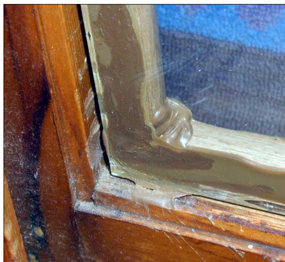
A close-up of the brown butyl mastic. Note the fillet between the two strips of capping to make an airtight seal.

and it merely acts as a spacer. It follows, especially given the plastic ('semi-liquid') properties of butyl mastic, that the weight of our second pane of glass will be resting on the bottom rail of the window frame. Now the moment of truth: using clean dry cotton gloves, carefully align the inner pane, resting it on the bottom rail of the window frame. Press it into place with a hand placed in the middle of the sheet of glass. If all goes according to plan, a continuous contact between mastic and glass will form around the perimeter, sealing off the trapped air between the two sheets.