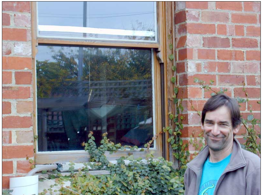
You'd be happy too if you double glazed your house for $30 a window!

There are a number of benefits of double glazing that I can see.